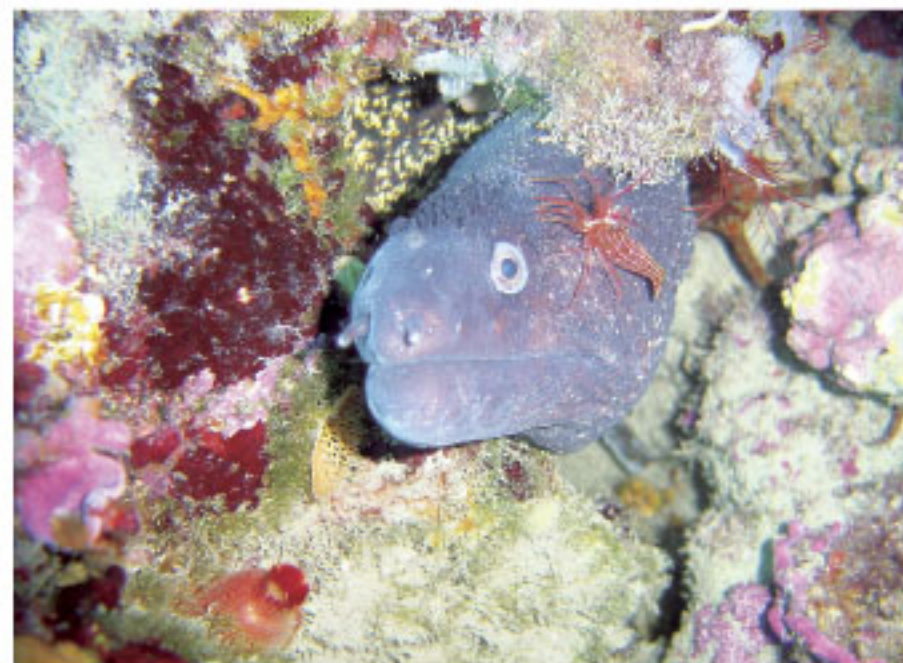
Above: Moray eel were seen on every dive Left: Octopus hide in nooks and crannies

Sainte Maxime and Le Lavandou have recently been added to the list of destinations. These will appeal more to wreck and technical