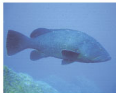
Grouper up to two-foot long are some of the larger species off Cap d'Antibes

Descending above the wall as opposed to the plateau, we set off in a different direction to take in a new area of the site. This was a quiet dive, with few divers on the boat and, as a result, the local marine life seemed more receptive to their Sunday morning being interrupted by two bubble-blowing humans! An octopus lounging on the rocks was quick to shrink into its hole, but a short wait hovering close by saw the octopus show its face again. Moments later we were approached by a grouper, who then backed off nervously. Again, with a patient hover, the two-foot fish regained its confidence and there we remained, looking at each other for several seconds before the grouper got spooked and