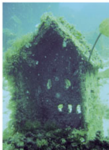
A few buildings at 15m are all that remain of Le Village , a film set from the 1960s

the dive boats, where we would find up to three anchored at a time.